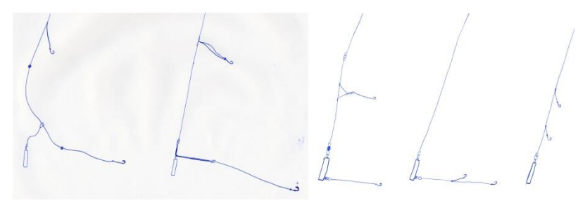
Examples of common traces

Please just keep in mind, have the fish netted/gaffed when brought to the surface or try lifting the fish by getting hold of the line and bring it in carefully that way. Please do not lift the fish on board with the rod. If the fish in the process falls off the trace or the pirk it can cause severe personal damage.